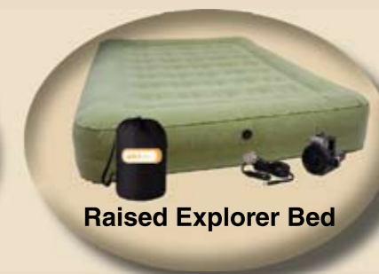
Raised Explorer Bed