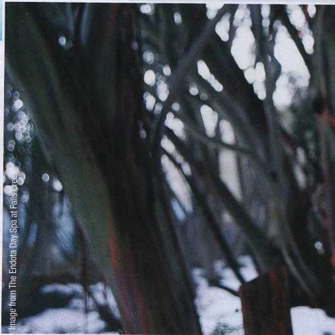
Image from The Endota Day Spa at Falls Creek

Further info: Stay at the Fairmont Banff Springs resort in a 'spa room' for easy access to Willow Stream in your slippers.