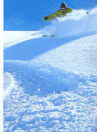
AUSTRALIA. 2004. NUFF SAID

Kamikaze is a proven powder haven. Out of bounds try Mt Blue Cow summit to the Guthega road.