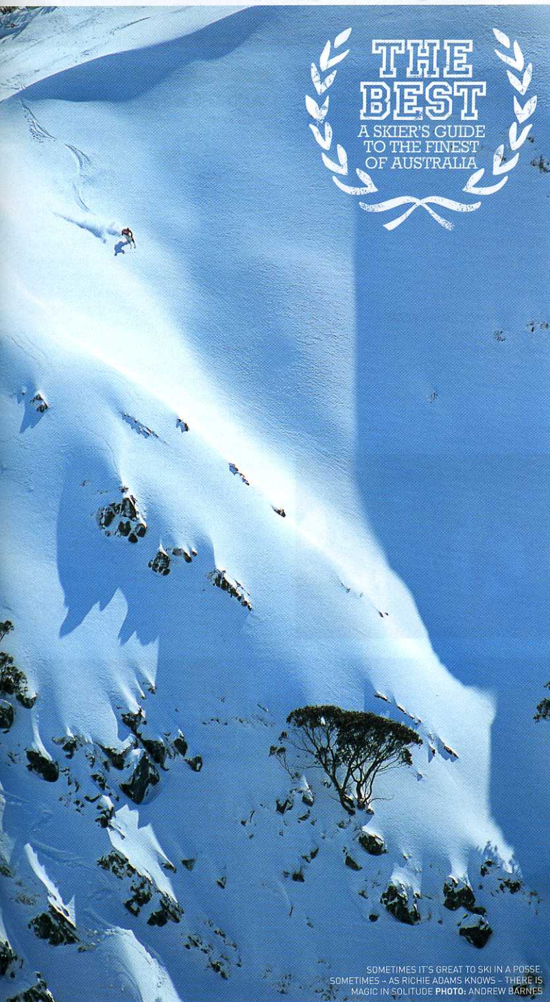
SOMETIMES IT'S GREAT TO SKI IN A POSSE. SOMETIMES - AS RICHIE ADAMS KNOWS - THERE IS MAGIC IN SOLITUDE

We're a naturally rivalrous bunch, we Aussies, swapping insults between States, convinced our own ski area is the best. I can't give a blue ribbon to any of them, they've all got their strengths and their hidden secrets. At the end of the day all that matters is if your face hurts from smiling. A smile is a ski secret you want the whole world to see, it means you got the best stuff.