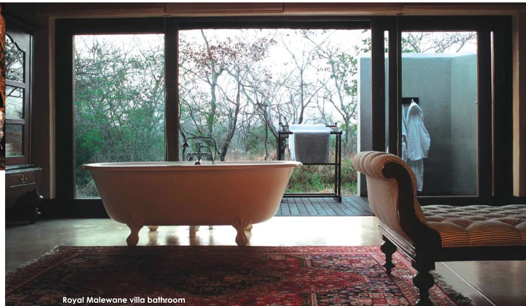
Royal Malewane villa bathroom

CC Africa ( www.ccafrica.com ) have a number of super lodges including the intimate Ngala Luxury Tented camp which sits on a riverbed that transforms into an open air dining pavilion by flaming torch light. Ngala Private Game Reserve is a private reserve of 14 700 hectares filled deep within the Kruger National Park. ►