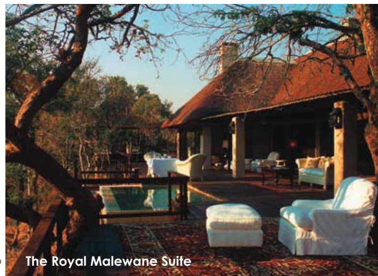
The Royal Malewane Suite

Londolozi Game Reserve in the Sabi Sands region features Tree Camp ( www.londolozi.co.za ) with six villas adorned in Ralph Lauren interiors built into the forest. Or choose the bling of Granite Camp's three villas in exposed