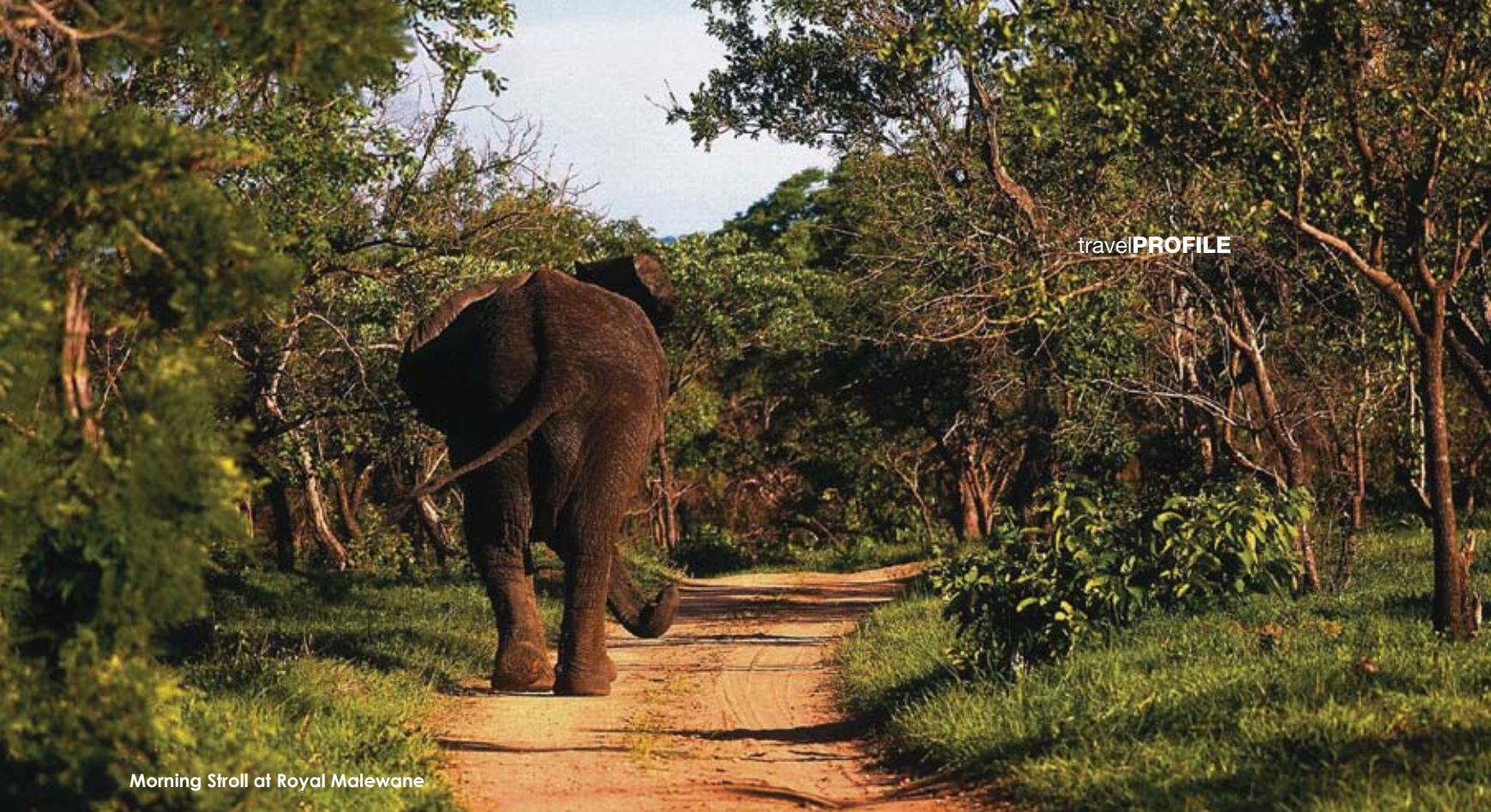
Morning Stroll at Royal Malewane

◀ The fantasy Moroccan styled Madikwe Safari Lodge , also of CC Africa, is in the north west province on the border of Botswana and home to the endangered African wild dog alongside elephants, hyenas, lions and the like. Expect chilled champagne bottles hanging from silver ice buckets on lantern lit trees by night and pancake pit stops by waterholes of a morning. It's just one of the many personalized surprises that CC Africa specializes in.