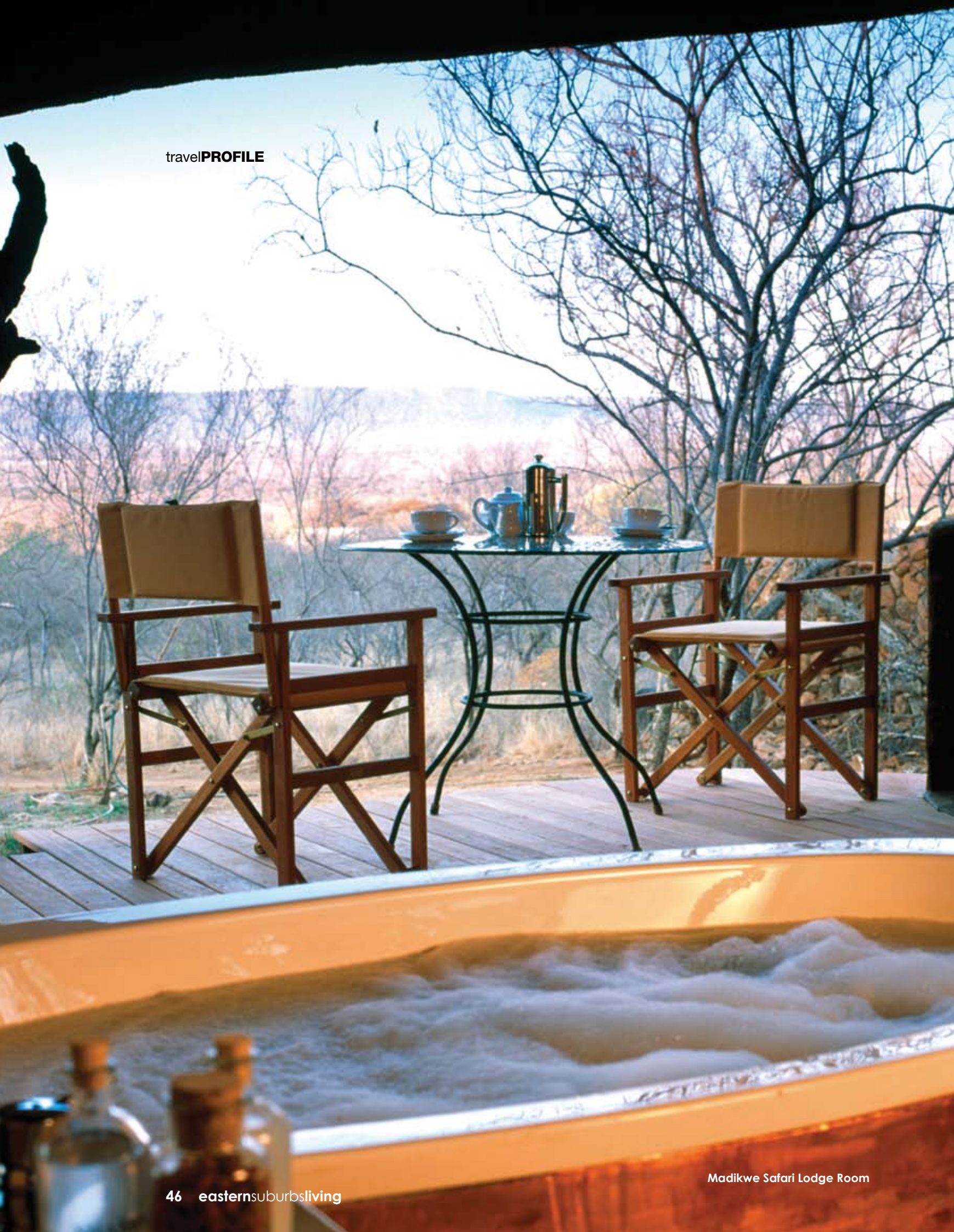
Madikwe Safari Lodge Room