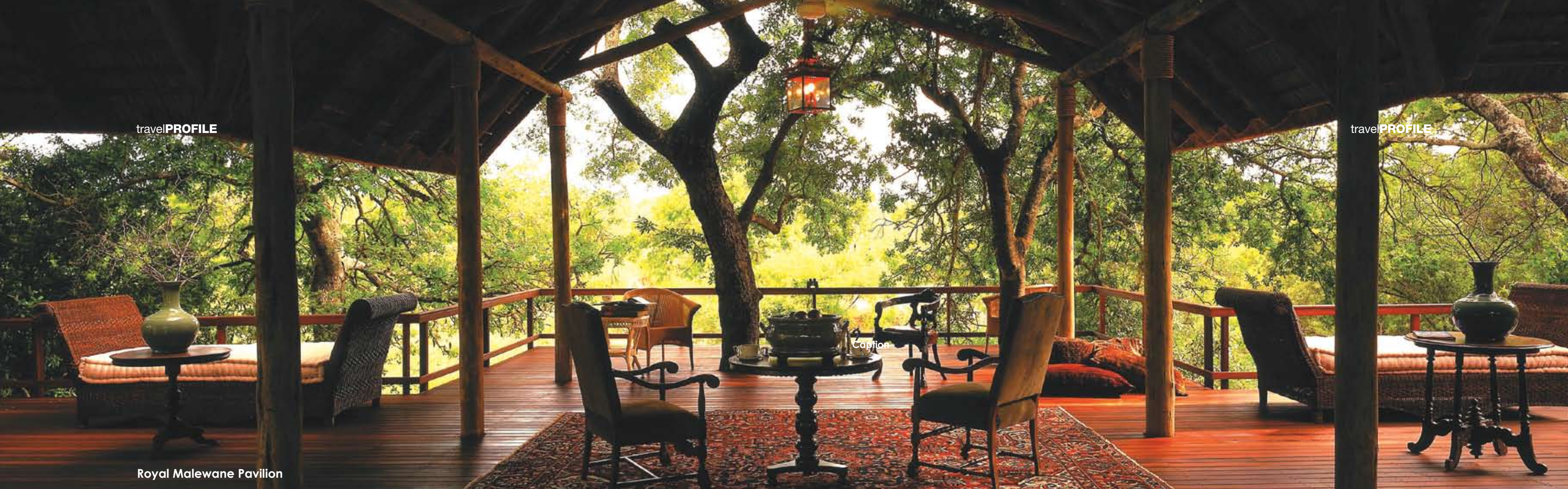
Royal Malewane Pavilion