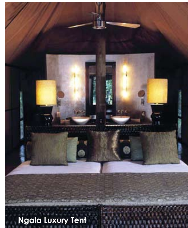
Ngala Luxury Tent