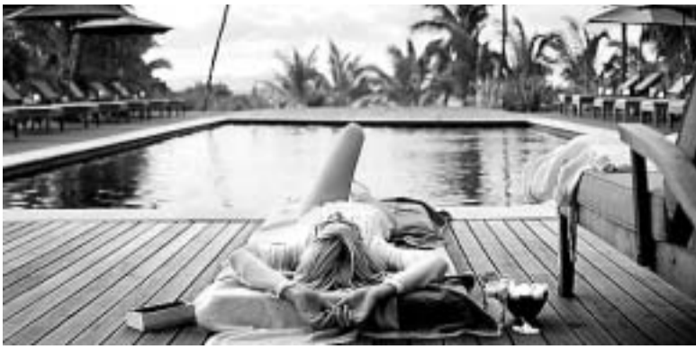
All day to sleep: beside the pool on Fiji's Vomo Island.