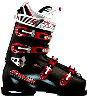
The Nordica Speedmachine 110

Rossignol caters for the big mountain dad with the super-hot S7 ($2999) ski. This powerful big mountain ski is a status symbol on the slopes this winter and is in hot competition with the Armada JJ ($1149) for powder ski of the year. For a scaled-down versions try the Rossignol S3 ($1299) which is perfect for powder, park and piste. Mums can choose from the entire K2 women's ski line with funky names like Burning Luv, Tough Luv and Fat Luv.