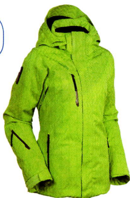
Rossignol, The Supernova jacket