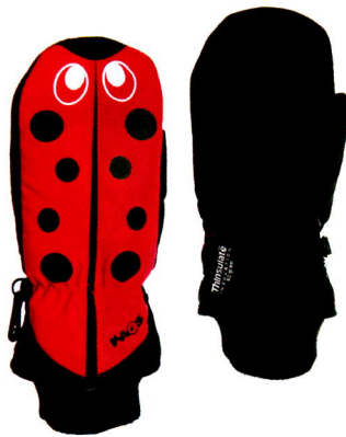
The KAOS Creatures ladybug mittens