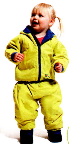
Gondwana Snug Jacket & Ouse Pant