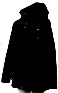
Volcom recycled polyester jackets