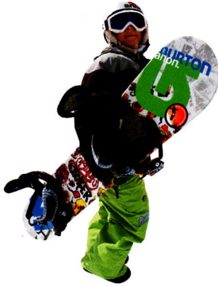
A cool snow dude in Burton

with the K2 Bad Seed ($499.00) or try the high powered Volk Junior Gotama rocker ski ($1299) for the older youth. If he prefers racing then the Rossignol Radical J ski ($399) will suit him fine and the Rossignol Fun Girl ski ($399) will have little sis at the front of the lift line.