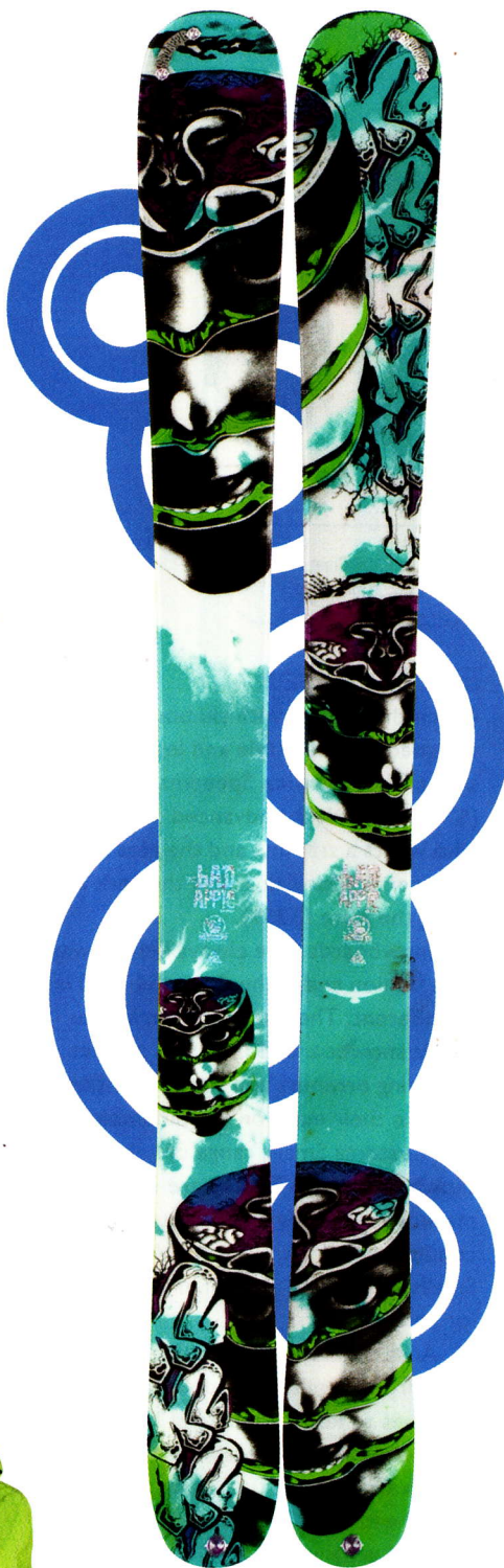
K2 Bad Apple skis

Rojo outerwear has upped the fashion ante for young girls on the mountain. Think fur-lined hoods, pretty pinks, soothing checks, matching