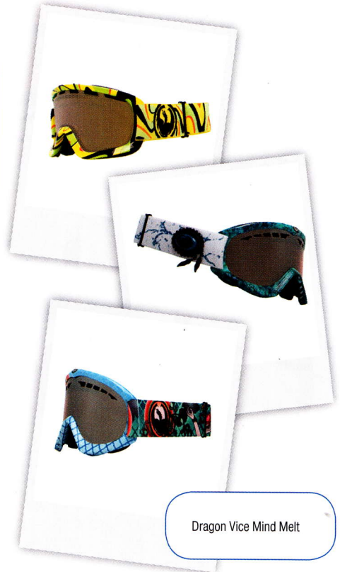
Dragon Vice Mind Melt