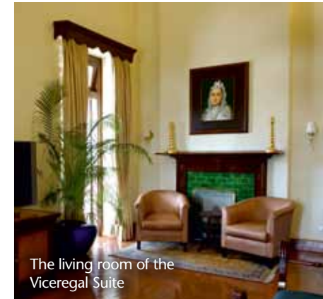
The living room of the Viceregal Suite