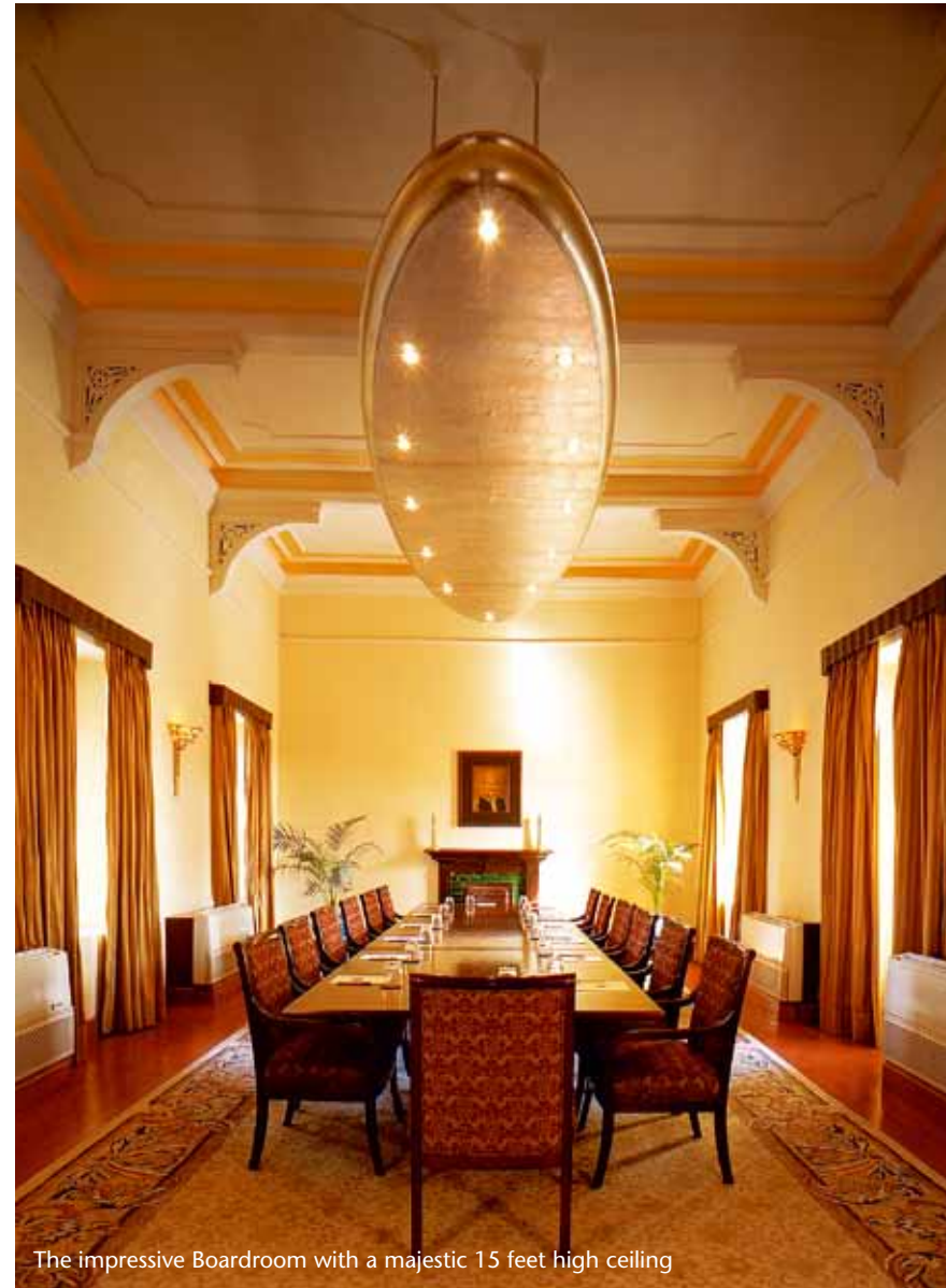
The impressive Boardroom with a majestic 15 feet high ceiling

RACHAEL OKES-ASH DISCOVERS WHAT MAKES THE ANANDA SPA IN INDIA A WORLD-CLASS DESTINATION SPA FOR HOLLYWOOD CELEBRITIES AND BOLLYWOOD BEAUTIES.