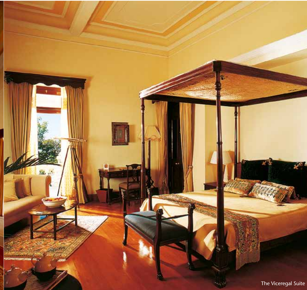
The Viceregal Suite