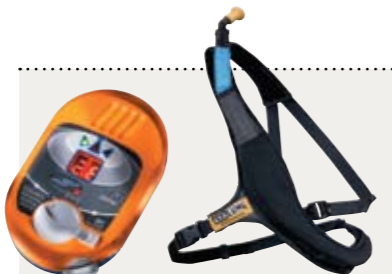
Gear on assignment

The 40 odd folk on the mountain lodge deck at lunchtime are constantly entertained by us virgins negotiating the towropes, dropping off like flies till we get it right. The boys and I follow Heather across Hamilton Face, traversing its wide-