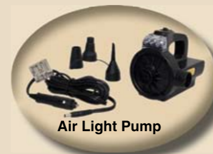
Air Light Pump

More great outdoor products from AeroBed: