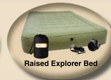
Raised Explorer Bed