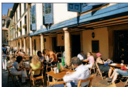
Oviedo's full of good food (left), but the dinosaur museum (right) could be a surprise

Once the capital of Christian Spain, Oviedo, about 30km from Gijon in the northwest of the country, can trace its history from 761, when two monks built a church dedicated to Saint Vincent of Saragossa. The capital of Asturias, one of the few Spanish territories to avoid invasion by the Moors, Oviedo has a unique collection of well-preserved, pre-Romanesque ninth-century buildings that are now World Heritage listed ( whc.unesco.org ). Among them are the churches of Santa Maria del Naranco, San Miguel de Lillo, Santa Cristina de Lena, San Julián de los Prados and the