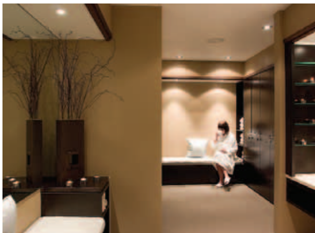
Story by Rachael Oakes - Ash

Gone are the days of a simple Swedish massage from a therapist wearing white. The spa industry has bloomed in the past decade with massage menus featuring hot stones, chakra aligning, ayurvedic oil streaming, deep tissue, shiatsu and Hawaiian lomi lomi. Add facials and body treatments using products containing essential oils, oxygen and even crushed diamonds and the spa competition begins to heat up.