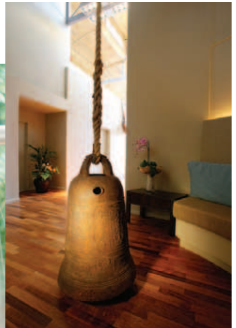
Main: Be invigorated with a Vichy shower at Daintree Eco Lodge and Spa Above: The old bell at Spa Du Vin in New Zealand Far left: Life is blissful at Spa Chakra on Hayman